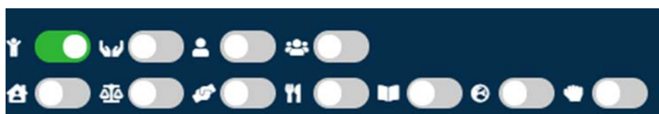
Image 5. Categories and subcategories of the CarePath Mechanism

Given the big number of organizations and agencies included in the Mechanism, it gives the users the possibility to filter their search. On top of the page, four categories of expertise are provided: Children, Care Leavers, Adults, Family . The user can select more than one of the expertise and automatically the system shows subcategories allowing for further search filtering. The subcategories are: Accommodation, Legal Aid, Psychosocial Support, Food-Personal Hygiene, Education, Immigration, Advocacy . This customized search allows users to filter the information they are looking for.