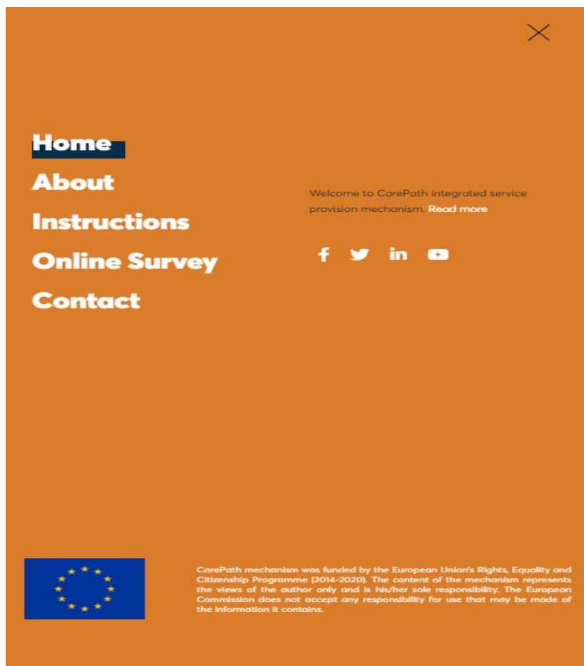
Image 6. The CarePath Mechanism Menu